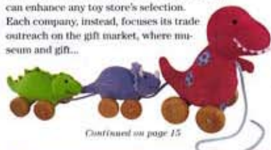
Continued on page 15